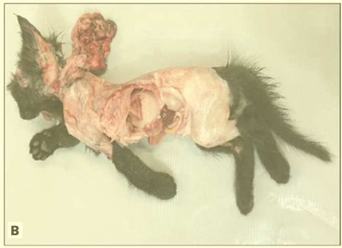
Figure 1 - Left side view of the body showing the traumatic evisceration before (A) and after (B) skin removal, showing also topographic abnormalities of its viscera through abdominal opening.